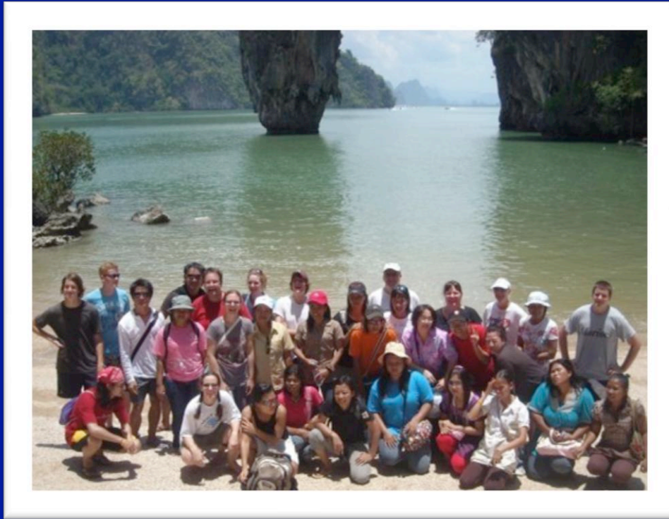
Step Ahead All Together at 2008 Staff Conference